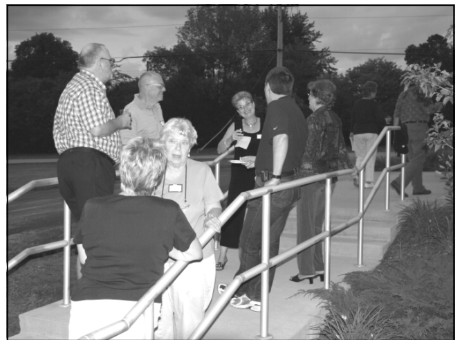
Wine, Cheese and Jazz Evening July, 2006

Our continuing focus this year will also include opportunities to invite friends and neighbors to join us. We will host the second annual Wine and Cheese tasting, and Jazz event on July 21st on the church grounds. We will also be seeking ways to encourage more regular attendance at worship services, and, of course, conducting the fall pledge drive.